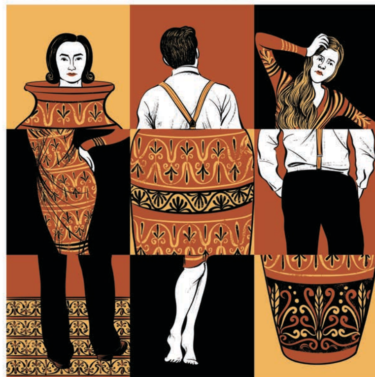
Illustration by Chloe Cushman